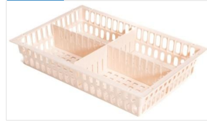
355 x 555 x 100(h) mm