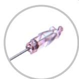
Needle Safety Guard

Safety I.V. Cannula with snap fit and perforated wings