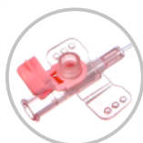
Snap Fit Cap