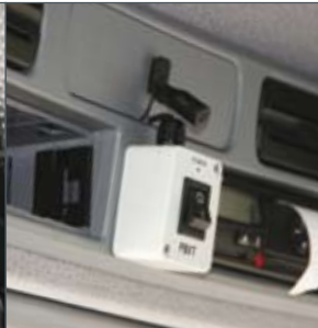
Pump Bay Voice Terminal switch