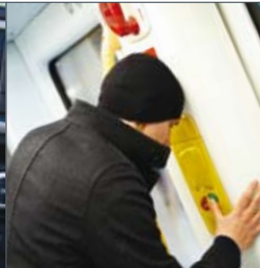
Customised Passenger Voice Terminals