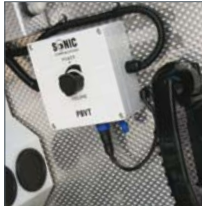
Pump Bay Voice Terminals for Fire & Rescue