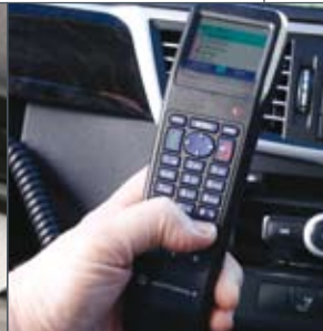
Integrated Vehicle Installations