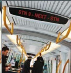
Integrated Passenger Information Systems