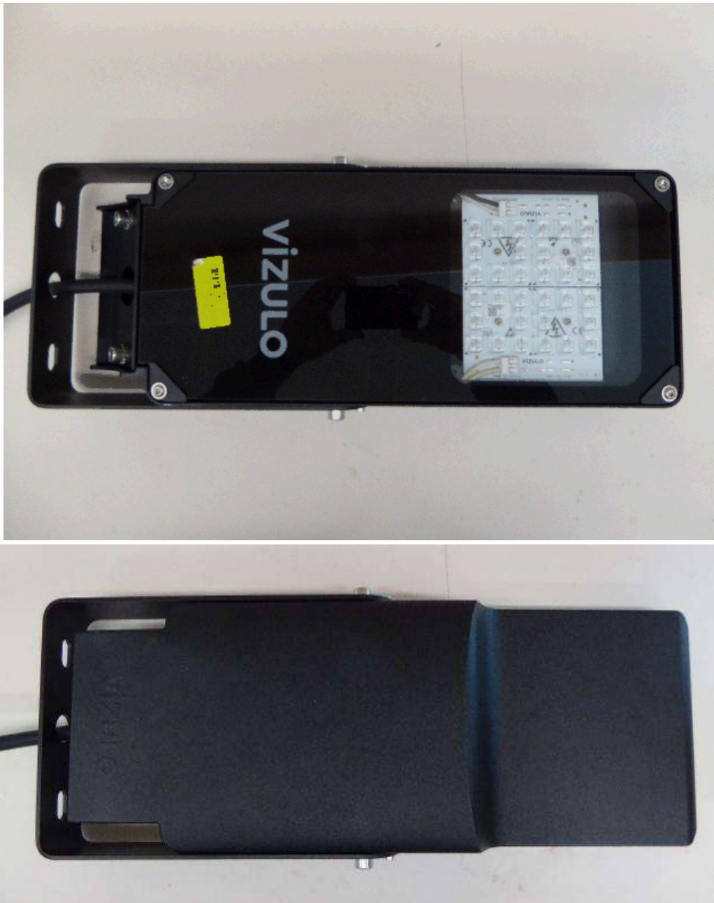
Figs. 1 and 2 – Front side and top side of Micro Martin