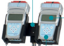
LCD display for impedance and signal information