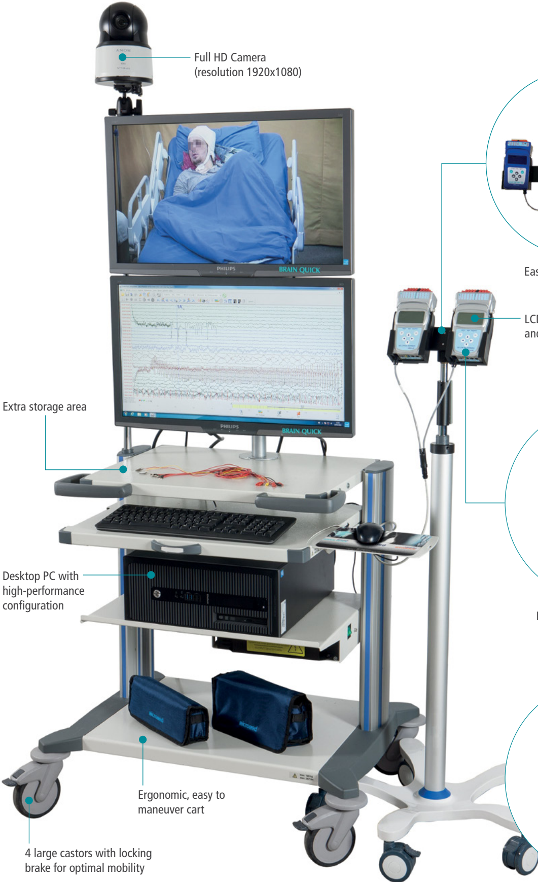
Full HD Camera (resolution 1920x1080)