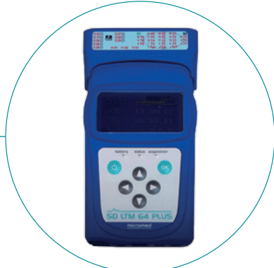
Interchangeable jack box and user friendly menu buttons