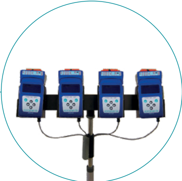
Easy channel expansion