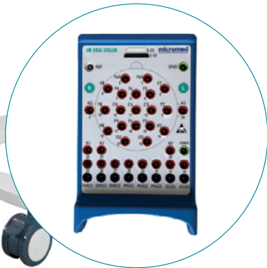
New jack box with EEG layout and 2 DSUB connectors for EEG Caps