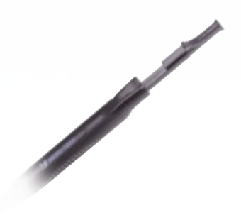
Compact ergonomical design