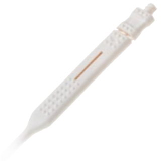
Ergonomical handle with defined breaking point