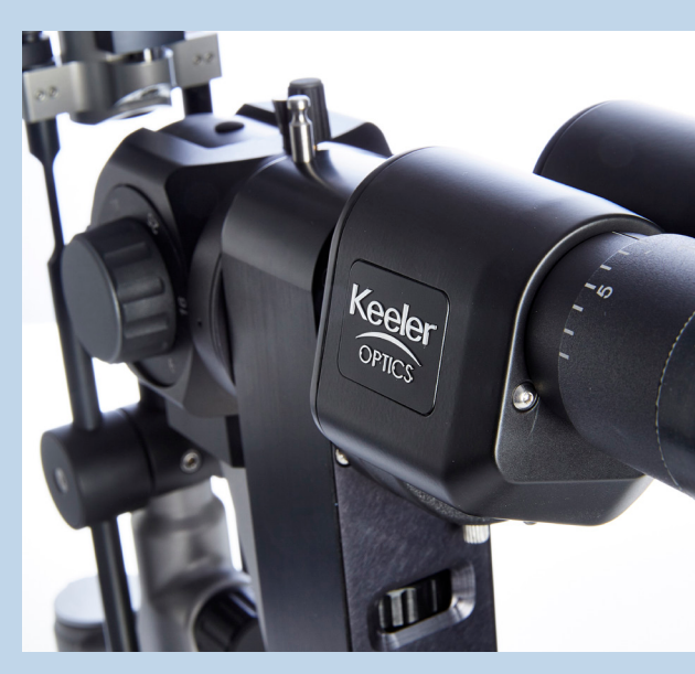
World Class Keeler Optics