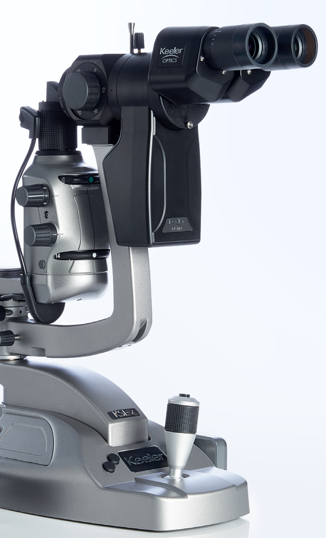
KSL-Z Digital Slit Lamp