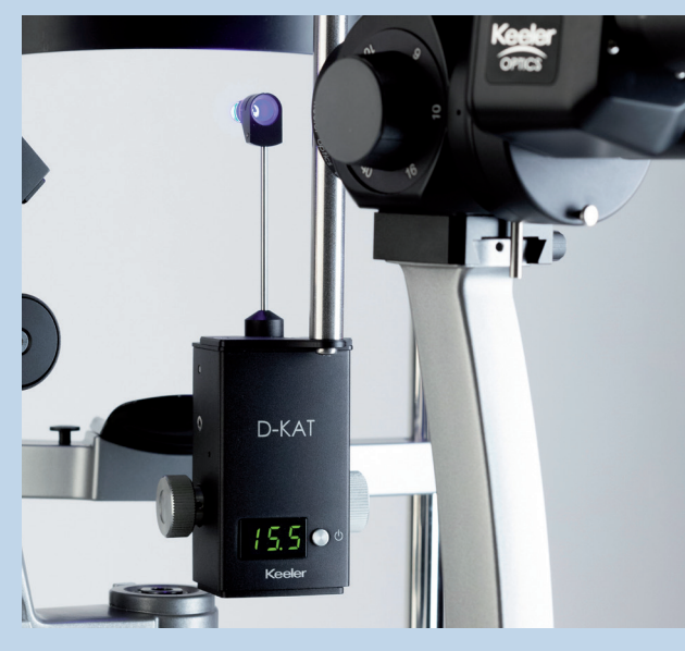
DKAT Digital Tonometer