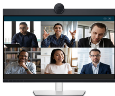
Dell 24 Video Conferencing Monitor - P2424HEB

Experience clear communication with this wireless AI-based noise cancellation headset, designed with a focus on productivity and comfort for all day conferencing.