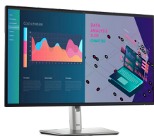
Dell 27 Monitor - P2725H

As the world's #1 monitor company 1 , Dell knows that the modern workplace requires more than PCs. We offer 200+ branded accessories to keep you connected and collaborative no matter your work style. Dell recommended solutions are designed and tested to connect seamlessly with your PC.