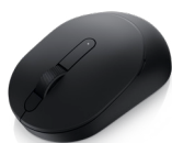
Dell Mobile Wireless Mouse - MS3320W

Collaborate confidently with this 2K QHD webcam that's essential for everyday use.