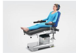
Beach Chair Position