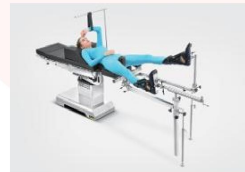
Supine Position (Orthopedic)