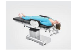
Supine Position (ENT/Neurosurgical—with head support)