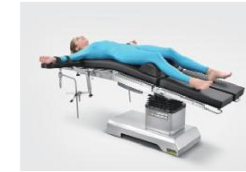
Supine Position (cardiovascular)

COMFORT 300 is suitable for surgical and examination with the high flexibility