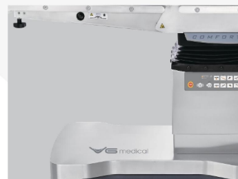
Germany electro-hydraulic system