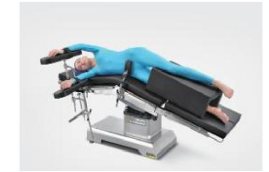
Lateral Position (pelvis and spine surgery)