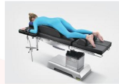
Prone Position (spine surgery)