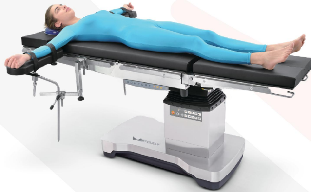
Supine Position (imagery space is 1200mm)