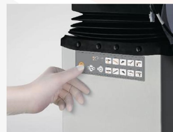
Emergency controlling panel