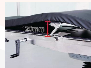
Integrated kidney elevator