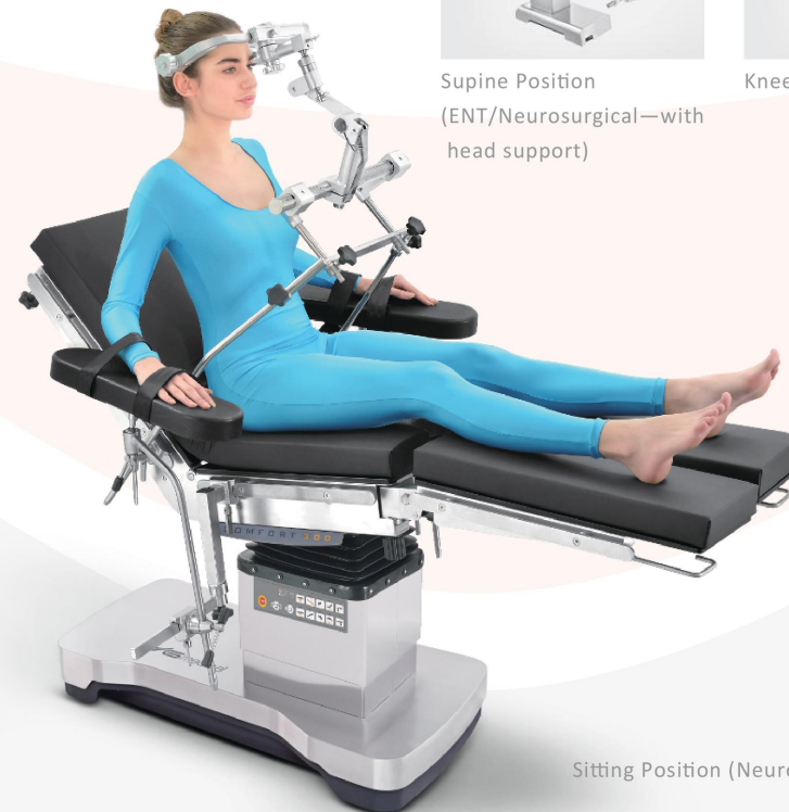
Sitting Position (Neurosurgical—with skull clamp)