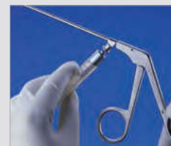
with cleaning connector