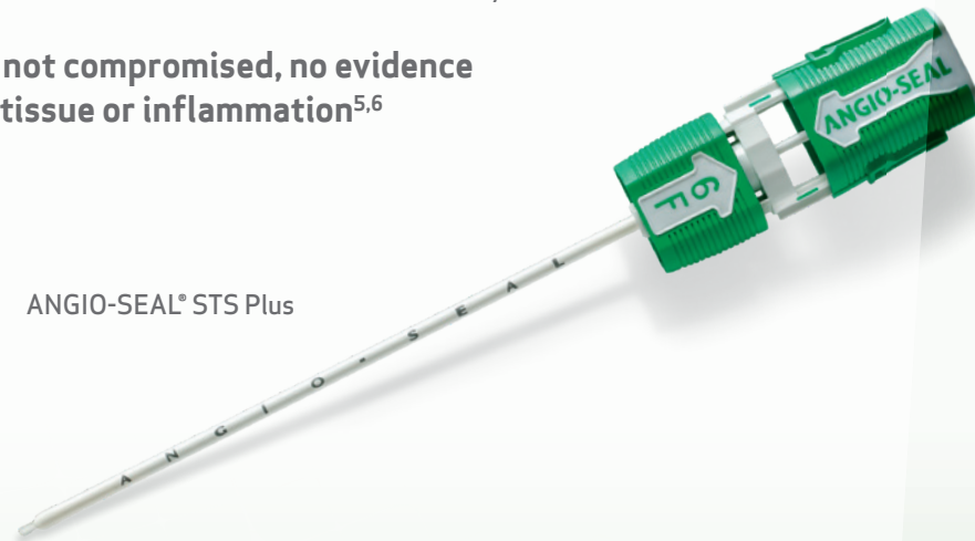
ANGIO-SEAL® STS Plus