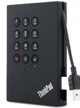
ThinkPad USB 3.0 Secure Hard Drive (PN: 0A65621)

Optimized for safeguarding essential data while on the go, this hard drive offers high-level, 256-bit Advanced Encryption Standard (AES) security within a slim, lightweight, self-powered, and easy-to-use design. It features an integrated, high-quality, metal dome switch keypad for entering an 8 to 16 digit password for one administrator ID and one additional user ID, if required.