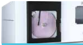
OPTIONAL GRAPHICAL CHART RECORDER