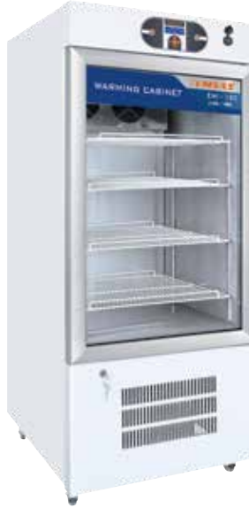
EMI 150 (+20/+80)