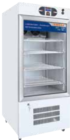
EKT 250 (2/8)