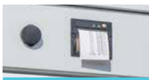
OPSİYONEL TERMAL YAZICI