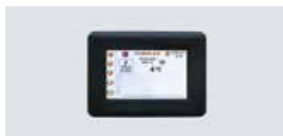
STANDARD TOUCH SCREEN DISPLAY