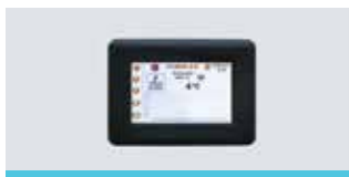
STANDARD TOUCH SCREEN DISPLAY