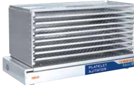
EAJ-L 09 54 PCS