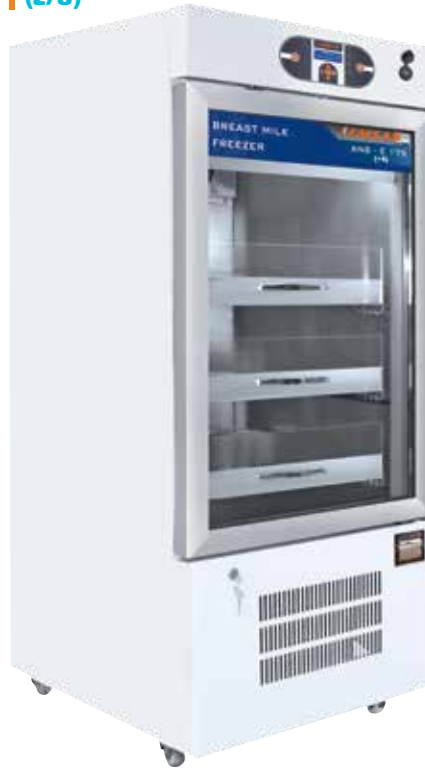
ANS-E 175 (2/8)