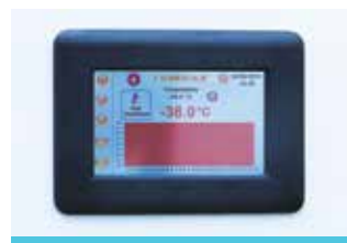
STANDARD TOUCH SCREEN DISPLAY