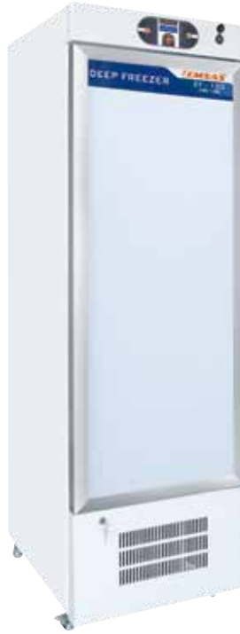
EF 150 (-20/-40)