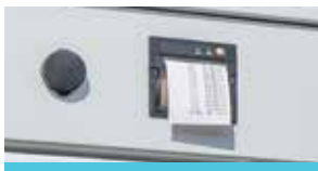
STANDARD THERMAL PRINTER