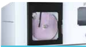
OPTIONAL GRAPHICAL CHART RECORDER