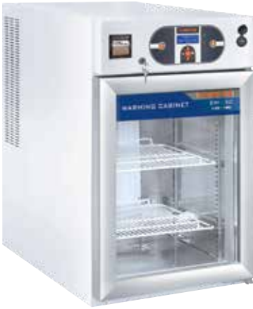
EMI 50 (+20/+80)