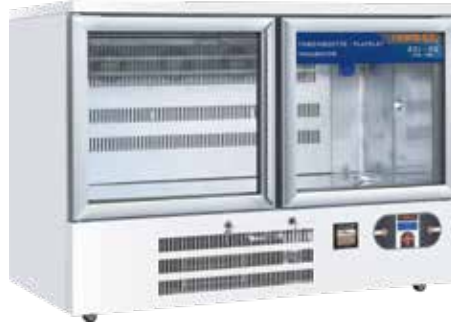
ECI 02 (+22/+24)