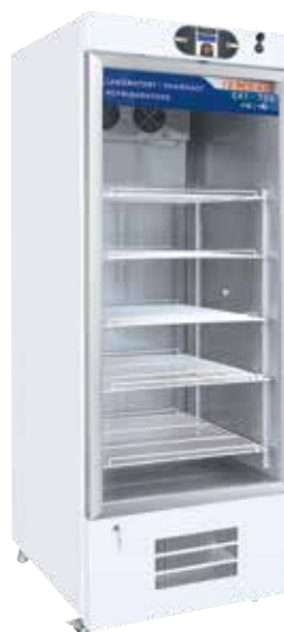
EKT 725 (2/8)