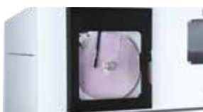
OPTIONAL GRAPHICAL CHART RECORDER