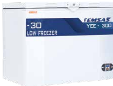
YEE 300 (-5/-30)