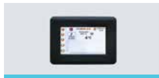
STANDARD TOUCH SCREEN DISPLAY