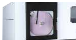
OPTIONAL GRAPHICAL CHART RECORDER