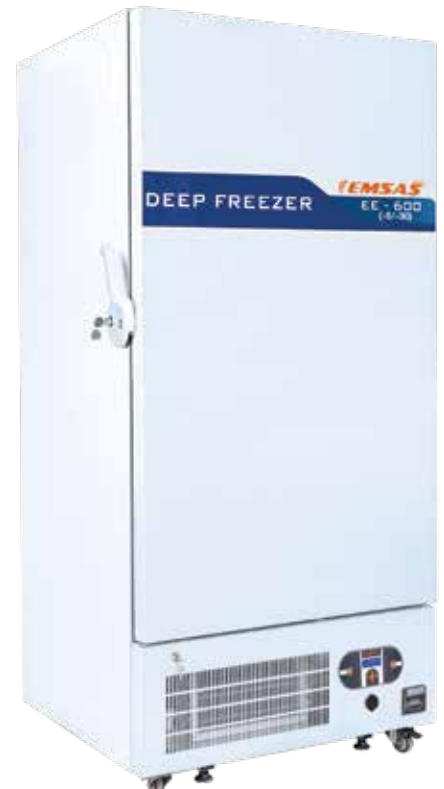
EE 600 (-5/-30)