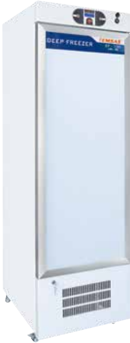
EF 100 (-20/-40)