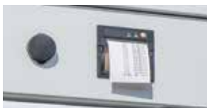
STANDARD THERMAL PRINTER