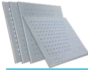
OPTIONAL CHROME SHELVES