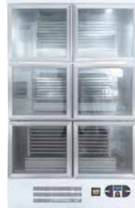
ECI 03 (+22/+24)