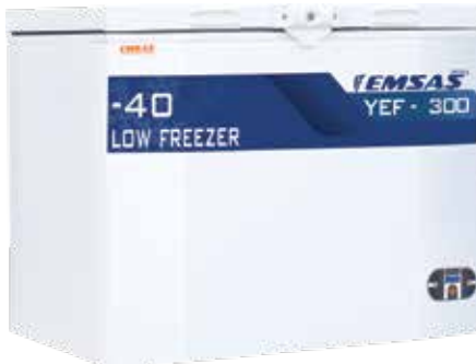
YEF 300 (-20/-40)