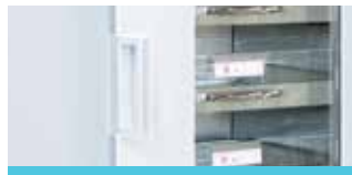
OPTIONAL BLOCK 3XGLASS DOOR