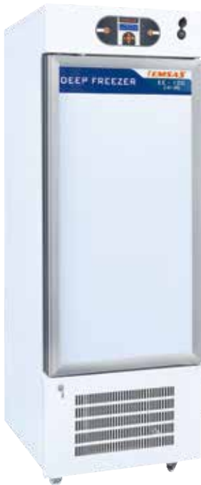
EE 100 (-5/-30)