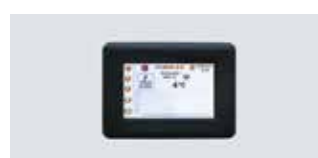
STANDARD TOUCH SCREEN DISPLAY