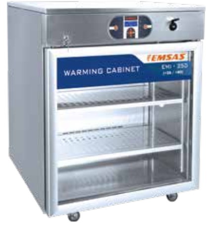
EMI 250 (+20/+80)