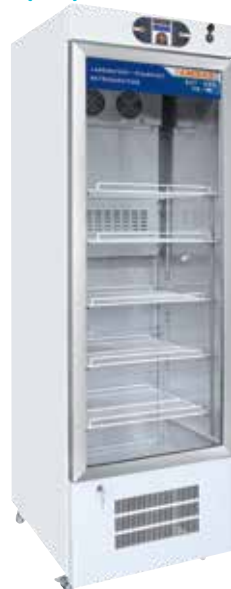
EKT 425 (2/8)