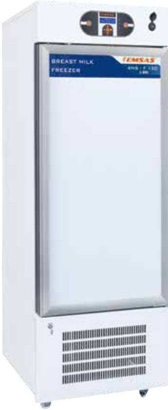
ANS-F 150 (-25)