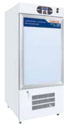
OPTIONAL BLOCK DOOR