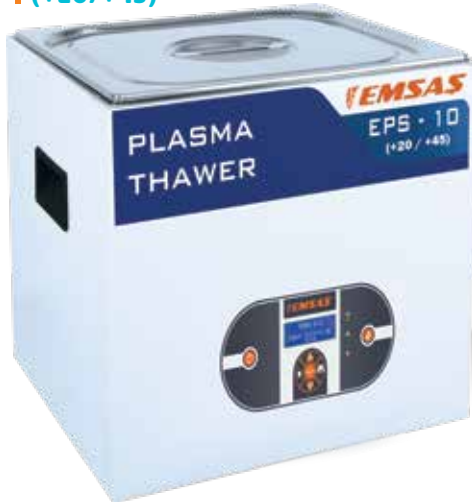
EPS 10 (+20/+45)