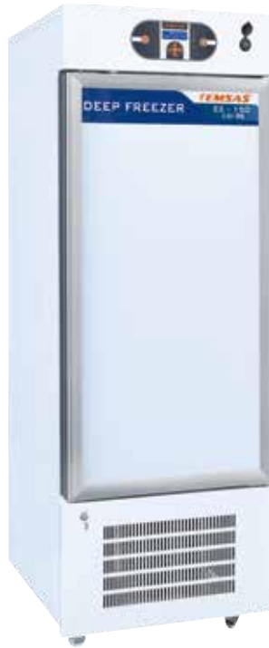
EE 150 (-5/-30)