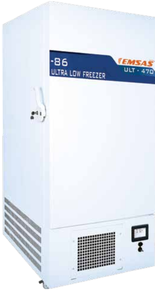
ULT 470 (-50/-86)