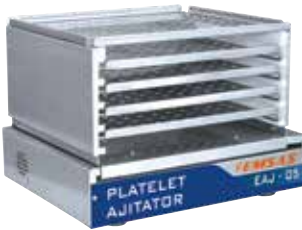
EAJ-L 05 30 PCS