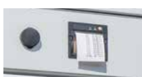
STANDARD THERMAL PRINTER