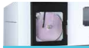
OPTIONAL GRAPHICAL CHART RECORDER