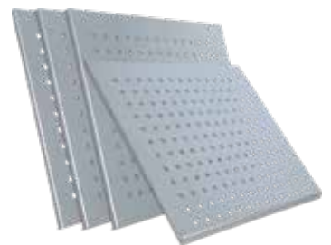
OPTIONAL CHROME SHELVES