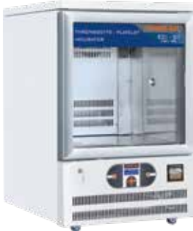
ECI 01 (+22/+24)