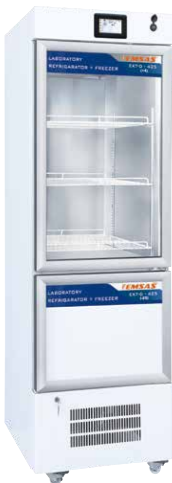
EKT-D 425 (2/8) (-5/-30)