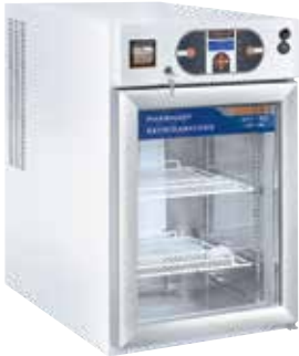
EKT 80 (2/8)