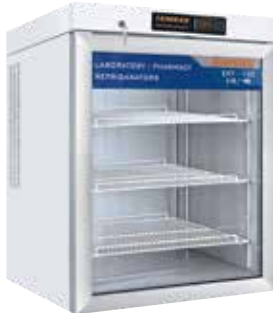
EKT 150 (2/8)