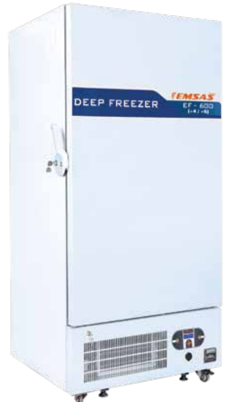
EF 600 (-20/-40)