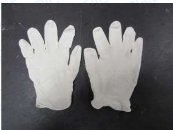
Gloves described as LOF_BG Latex Powder Free Non-Sterile Extra Rough (Textured) at fingertip surface