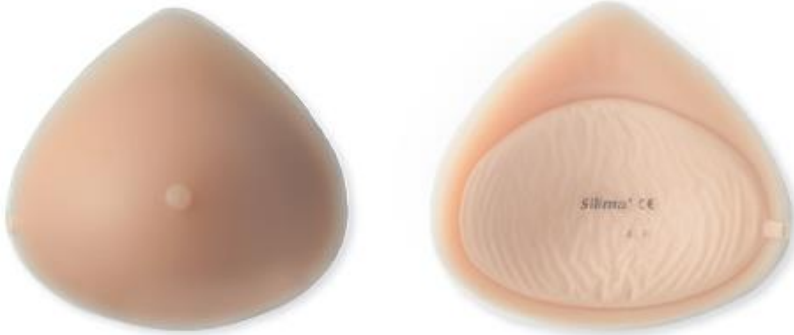
66 379 – symmetric Standard A/B Size 1 – 11