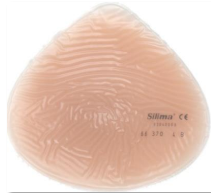
66 370 – symmetric Standard B size 1 – 11 Full C size 3 – 14