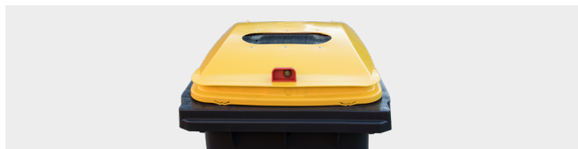
MIXED RECYCLING BRUSH OPENING