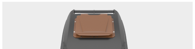
LID IN LID