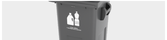
CUSTOMISATION BY THERMAL TRANSFER GRAPHIC