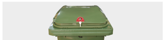
RED DOME LOCK (GRAVITY/NON GRAVITY)