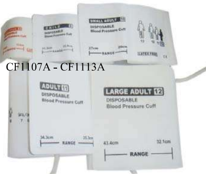
CF1107A - CF1113A