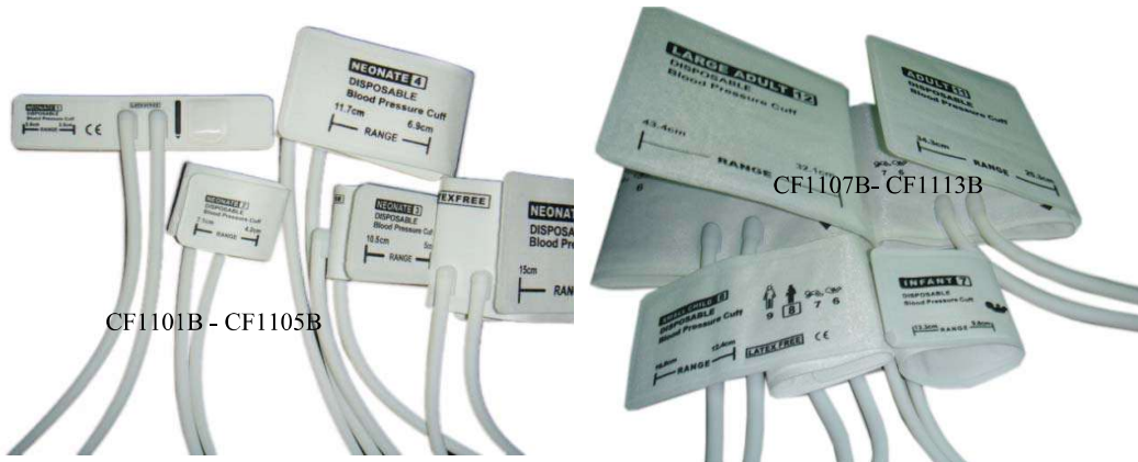
CF1101B - CF1105B