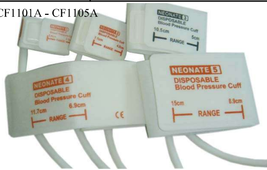
CF1101A - CF1105A