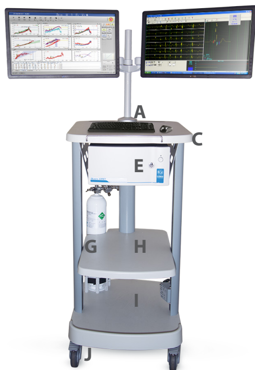
Quark CPET and 1-Cylinder Holder Medical Grade Cart (C03550-0*-04)