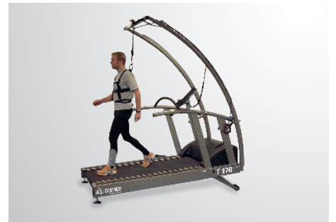
Downhill motion and downhill gait therapy is possible with belt reverse rotation module (standard feature on T170 Sport and T200/250 models)