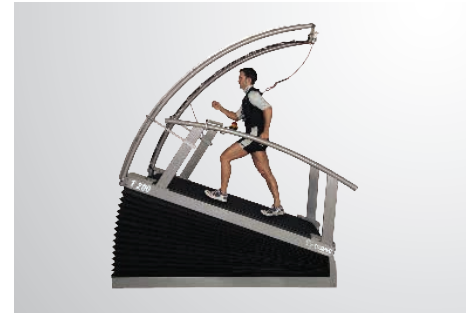
Elevation can be controlled either with user terminal or with PC software