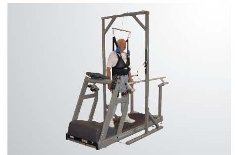
Unweighting system (Airwalk) for rehabilitation and for physiotherapy applications