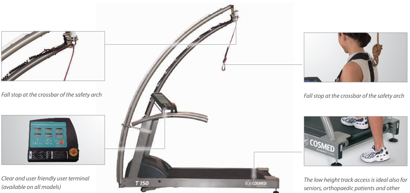
Fall stop at the crossbar of the safety arch