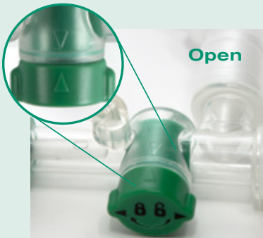
On the 72 hour TrachSeal products, open the isolation valve by aligning the two arrows.

Above based on published AARC clinical practice guidelines: Endotracheal Suctioning of Mechanically Ventilated Patients With Artificial Airways 2010.