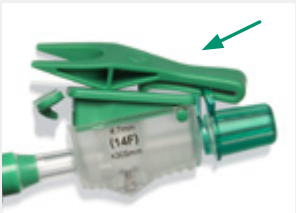
Remove the disconnection wedge from the retained cap.