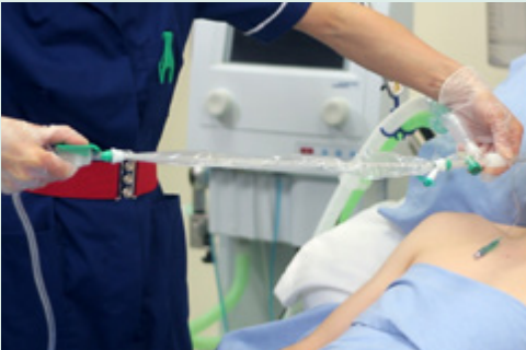
Push down the suction valve and slowly pull the catheter back in a straight motion. Suction should not exceed 15 seconds.