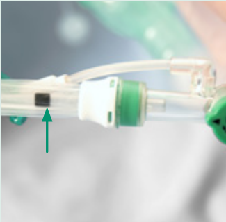
Withdraw the catheter until the black marker is visible on the distal side and you feel a click.