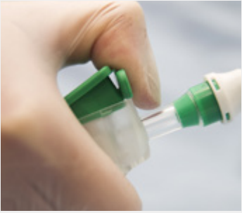
It is important to lock the suction valve at the end of the procedure. This ensures that the valve is not accidentally depressed, which could compromise ventilation.