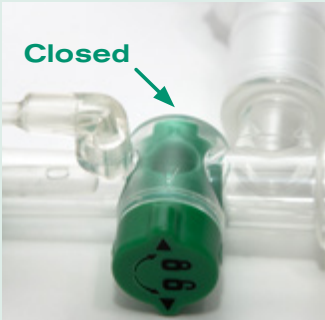
On the 72h product, lock the isolation valve after suctioning.