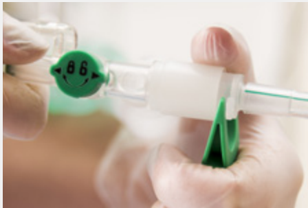
Use the included disconnection wedge to remove TrachSeal from the ET tube. Slide it between ET tube and TrachSeal and push upwards against your thumb. Discard TrachSeal following hospital procedure.