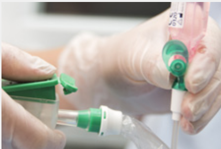
Open the cap of the rinsing port and attach a saline vial or syringe. Depress the suction valve to activate. Rinse until the catheter tip is clean. Close the rinse port cap when finished.