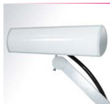
RECTANGULAR ANTENNA LONG FIELD