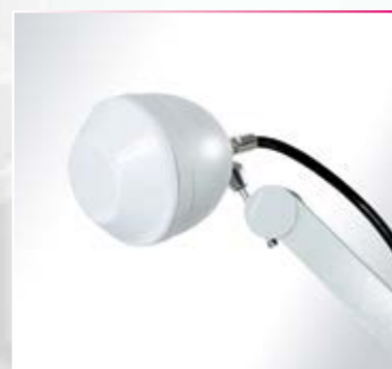
CIRCULAR ANTENNA LOCALIZED FIELD

Fisiowave has been carefully designed, with particular care to the functionality of the articulated arm, which allows for a full range of movement and easily supports any type of antenna supplied with the equipment.