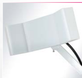
THREE-DIMENSIONAL ANTENNA ENCIRCLING FIELD