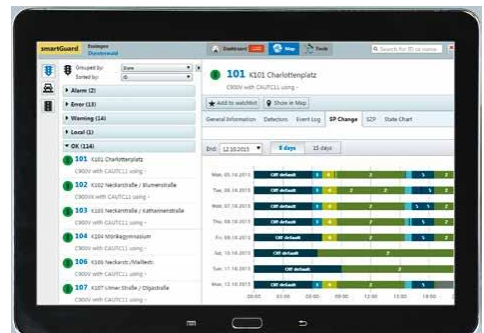
Signal plan archive