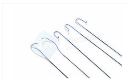
Radiology Angiographic Catheter