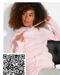
URBAN WOMAN SU1068