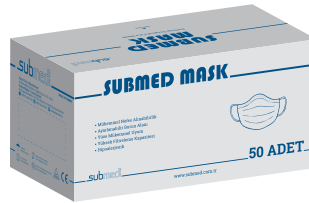
MS001-2 & MS001-3