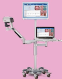
Swing arm stand full set