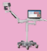
Swing arm stand with PC tray