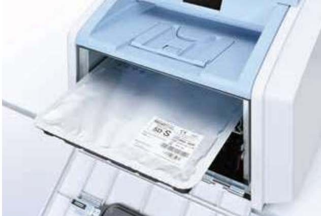
SD-S Film Cartridge

SD-S is specially designed for the Laser Imager DRYPRO SIGMA.