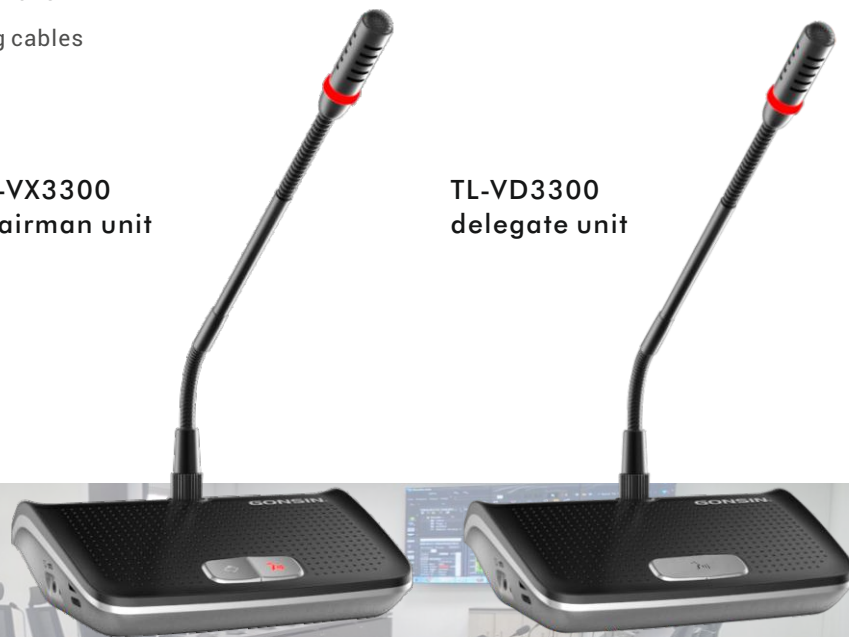
TL-VD3300 delegate unit