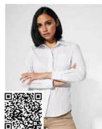
SOFIA L/S CM5161