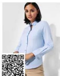
OXFORD WOMAN CM5068