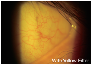
With Yellow Filter

Doctors can observe images at higher contrast with this yellow filter. As you can see from the comparison, the eye tissues look sharper under yellow filter. The filter can be mounted or taken off easily from our slit lamp.