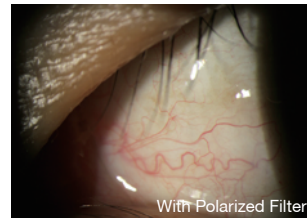
With Polarized Filter

Equipped with this module on slit lamp, doctors can see a clearer image of eyes as the filter can reduce the light reflected from the cornea. The filter can be mounted or taken off easily from our slit lamp.