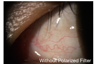
Without Polarized Filter