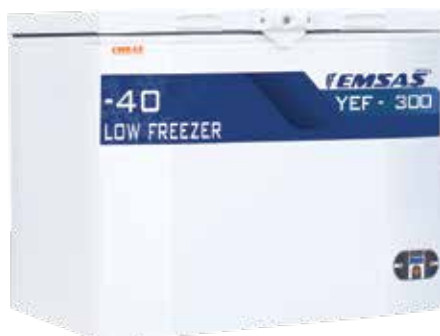
YEF 300 (-20/-40)