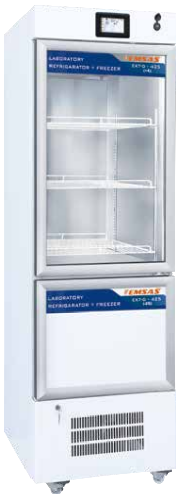
EKT-D 425 (2/8) (-5/-30)