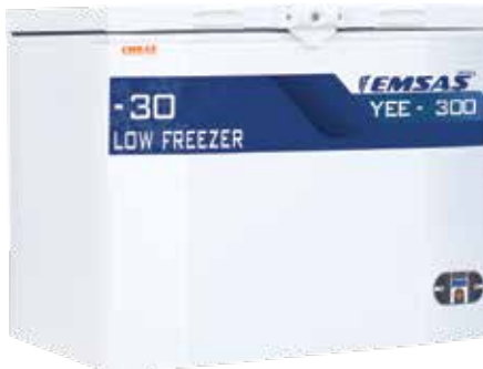
YEE 300 (-5/-30)