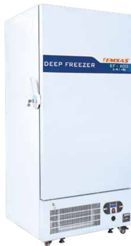
EF 600 (-20/-40)