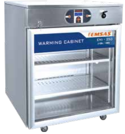
EMI 250 (+20/+80)