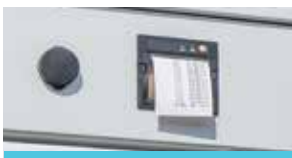
OPSİYONEL TERMAL YAZICI