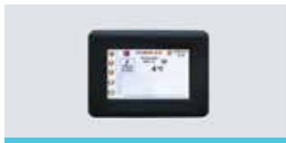
STANDARD TOUCH SCREEN DISPLAY