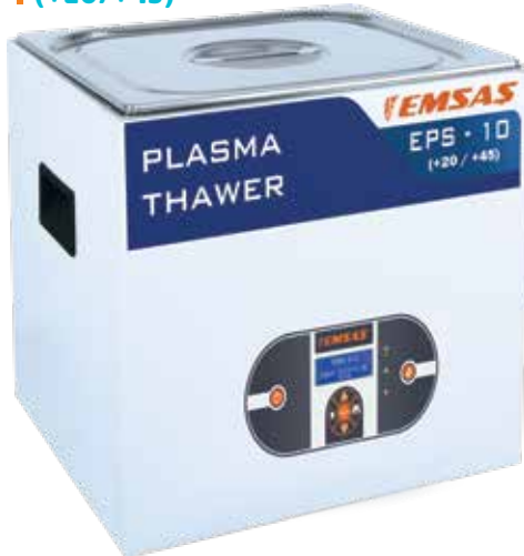
EPS 10 (+20/+45)