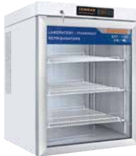
EKT 150 (2/8)