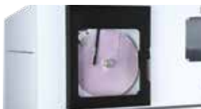
OPTIONAL GRAPHICAL CHART RECORDER