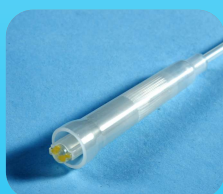
NPD Needle Protection Device**

Mitra Blood Bags are available with various combination of safety features including needle safety guard and pre-donation sampling pouch with luer adapter.