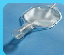
PDS Pre-donation Sampling Pouch**