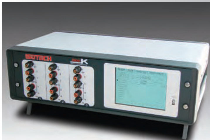
Unequalled combination of accuracy, stability and versatility.

"Performance by Design" was the mantra and passion behind the development of the microK. On Day 1 a decision was made, "no tweak pots" (such as used on AC Bridges to correct for flux leakage), no software adjustment, no "self-calibration" but performance by design. The microK achieves its resistance ratio accuracy by design, not adjustment and is uniquely drift free.