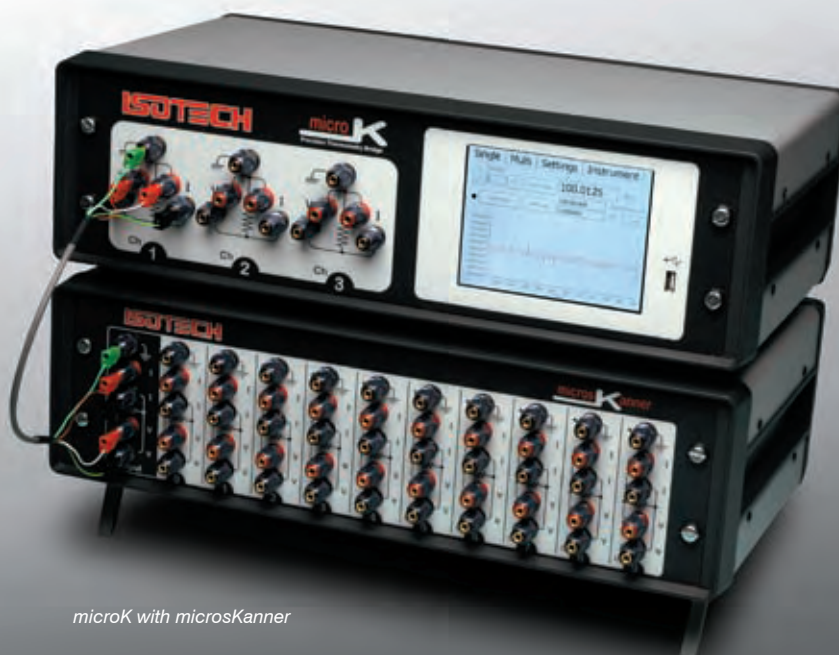
microK with microKanner