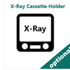
X-Ray Cassette Holder at Backrest