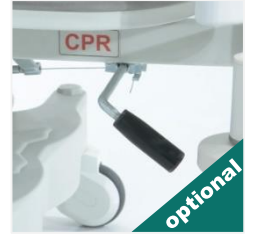
Dual Sided Manual CPR at Backrest