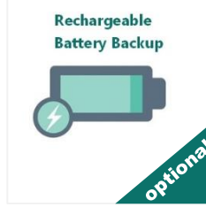
Rechargeable Battery Backup