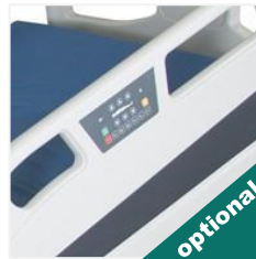
Control Panels Embedded on Side Rails