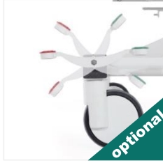
Central Brake Castors 150mm