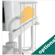
Oxygen Cylinder Holder