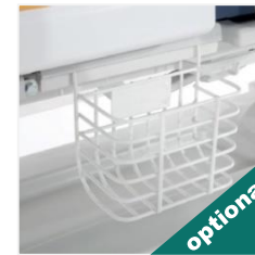
Urine Bag Basket