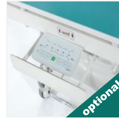
Nurse Panel Shelf