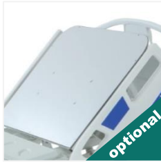
X-Ray Translucent HPL Backrest