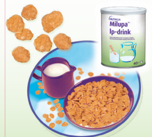
Serving suggestion/Servierorschlag/Serveersuggestie/ Suggerzione di presentazione/L'immagine ha il solo scopo di presentare il prodotto

Milupa Ip-flakes can be eaten as a snack on its own or combined with a suitable milk replacement e.g. Milupa Ip-drink