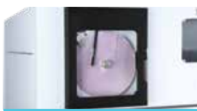
OPTIONAL GRAPHICAL CHART RECORDER