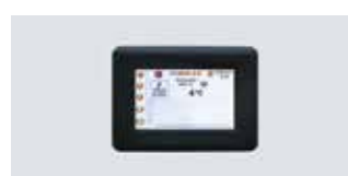
OPTIONAL TOUCH SCREEN DISPLAY