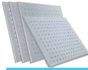
OPTIONAL CHROME SHELVES