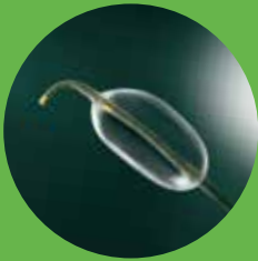
Copernic 2L Double lumen balloon microcatheter