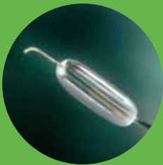
Eclipse 2L Double lumen balloon microcatheter