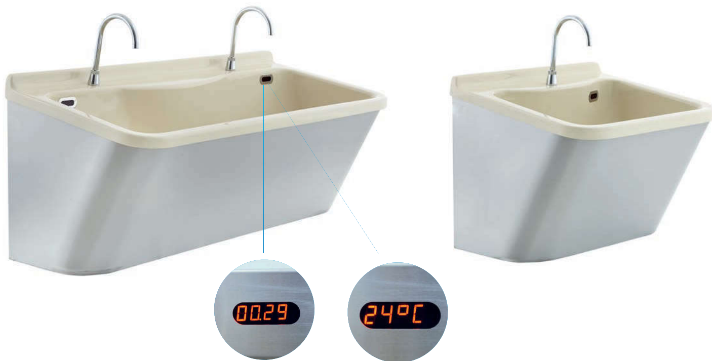
Water temperature and timer can be monitored on LCD display