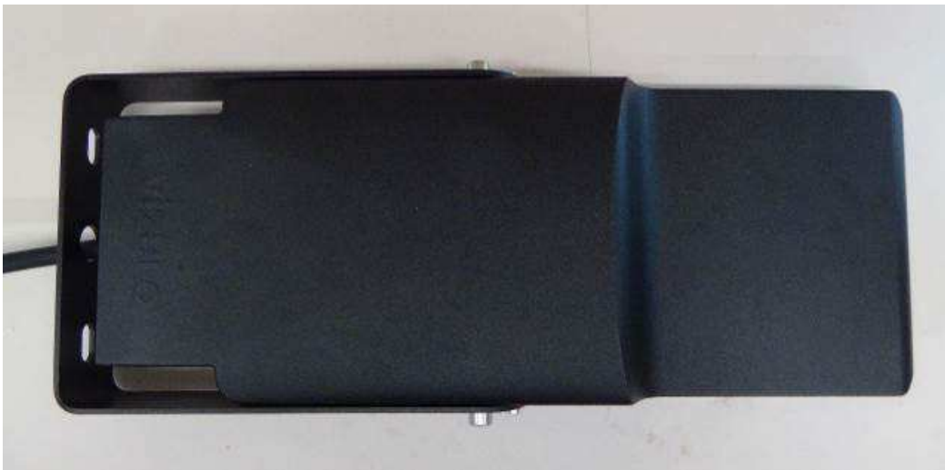
Figs. 1 and 2 – Front side and top side of Micro Martin