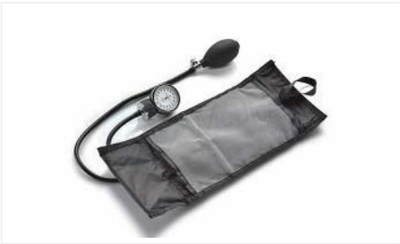
Pressure Infusion Bag

Hot Tags: high pressure tubing, China, manufacturers, factory, wholesale, discount, customized, buy, bulk, low price, price list, free sample