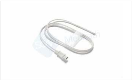
General Purpose Temperature Monitoring Probe