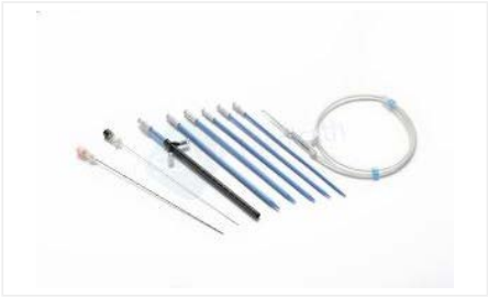
Percutaneous Nephrostomy Sets