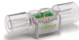
Neonatal Flow Sensor