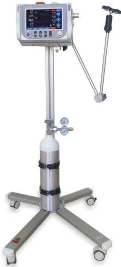
Ventilator Cart with tube holder