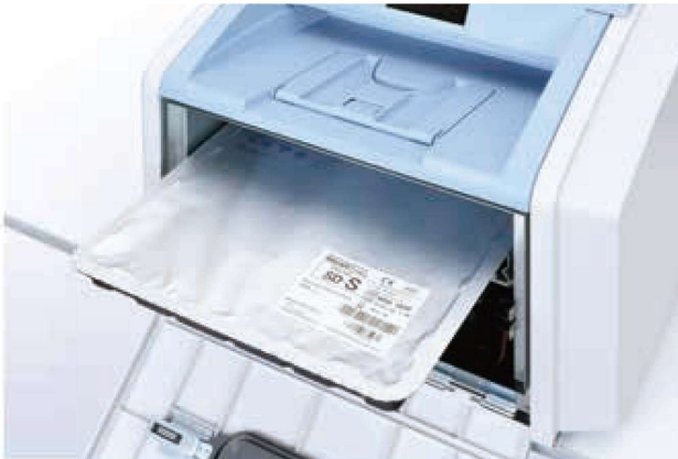
SD-S Film Cartridge

SD-S is specially designed for the Laser Imager DRYPRO SIGMA.