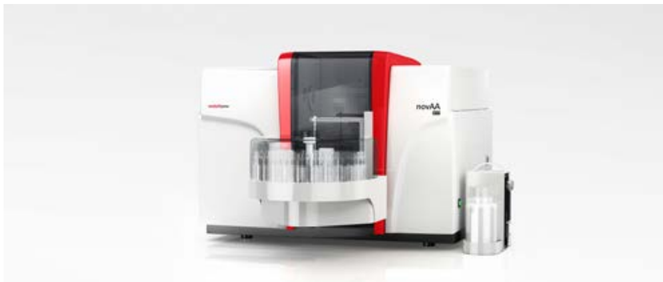
novAA 800 F with autosampler AS FD for flame technique