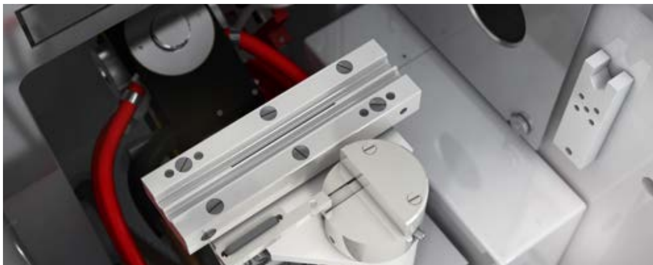
Burner head with Scraper and lowered graphite furnace (novAA 800 D)

The Scraper, an intelligent cleaning device for the burner head improves routines, especially when working with the acetylene-/nitrous oxide flame. It automatically cleans the slot before each measurement and in standby mode, thus guaranteeing a continuous and reproducible measuring cycle. It further contributes to lab safety and precision of results.