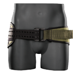
MILITARY OD GREEN /BLACK