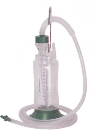
9034 Polyseal - Kid