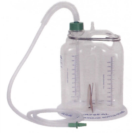
9033 Polyseal - Midi