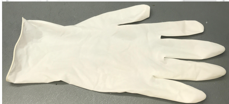
Photo: Latex Powdered Glove – (012296388), Size M