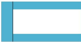
Mayo Masa Örtüsü / Mayo Table Drape