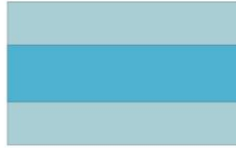
Alet Masa Örtüsü / Back Table Drape