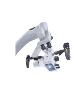
ZEISS TIVATO® 700