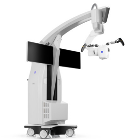
ZEISS KINEVO® 900 S

The innovative ZEISS SMARTDRAPE fitting to the following devices: