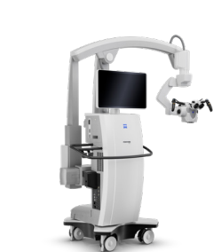
ZEISS PENTERO® 800 S