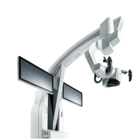
ZEISS KINEVO® 900