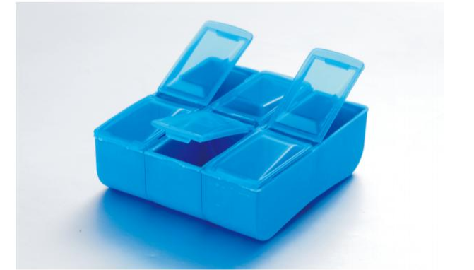
ST-HC16 6 Case Pill Box

Material: ABS+PS, Feature Crush and Store Pills Colour: Blue, Red, White, Function easy to use for pill Storage and crushing