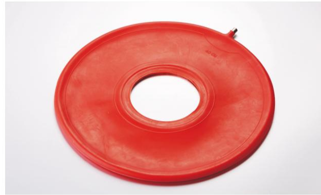
ST-HC08 Air Cushion Latex

Size: 30g 20×5cm, 50g 23×7cm, 140g 41×10cm