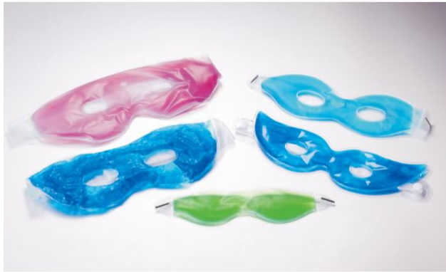
ST-HC07 Cold Eye Mask

Size: 30g 20×5cm, 50g 23×7cm, 140g 41×10cm