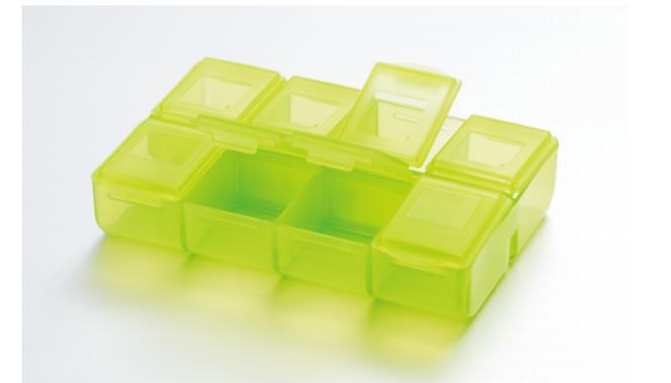
ST-HC18 8 Case Pill Box