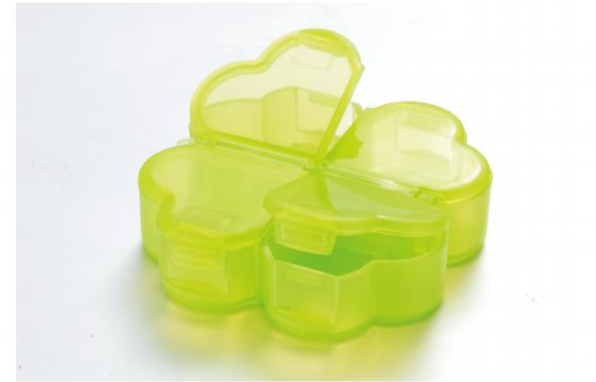
ST-HC15 4 Case Pill Box