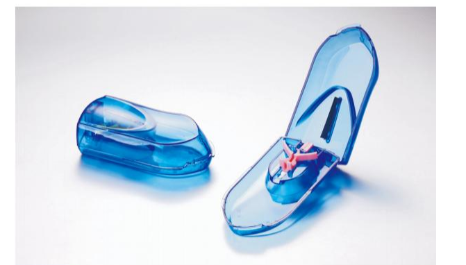
ST-HC22 Pill Cutter