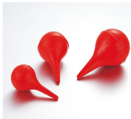
ST-HC10 Ear Syringe