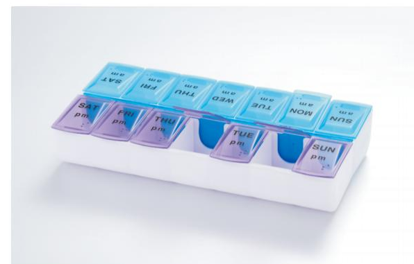
ST-HC19 14 Case Pill Box