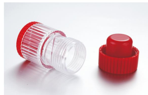
ST-HC21 Pill Crusher

Material: ABS+PS, Feature Crush and Store Pills Colour: Blue, Red, White, Function easy to use for pill Storage and crushing