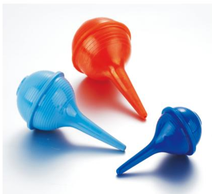
ST-HC09 Ear Syringe

Material: calcium carbonate+rubber Size: 35cm / 40cm / 42.5cm / 45cm