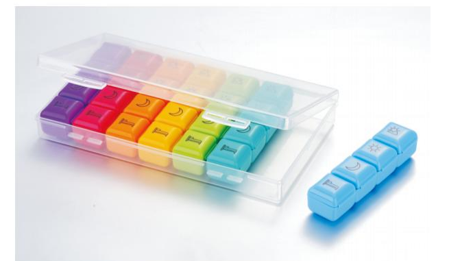
ST-HC20 28 Case Pill Box