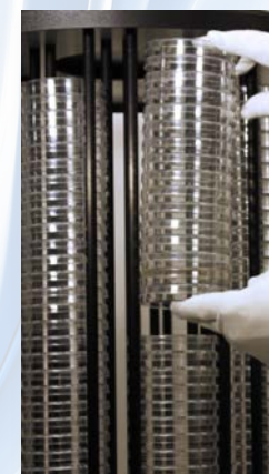
PS400 dish loading