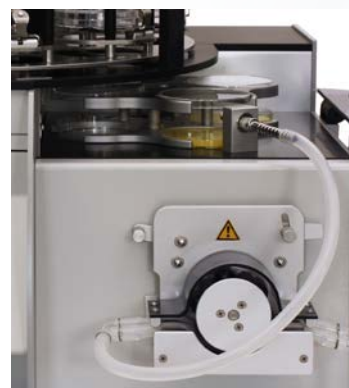
PS200 Pump head and filling chamber