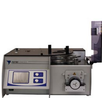
PS200 sequential process