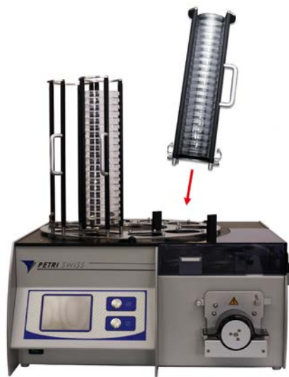
PS200 Easy handling