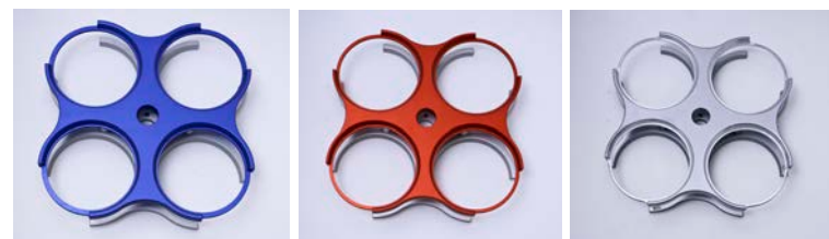
3 different separators